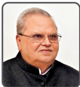
Shri Satya Pal Malik Hon'ble Governor, J&K State & Chancellor, University of Jammu